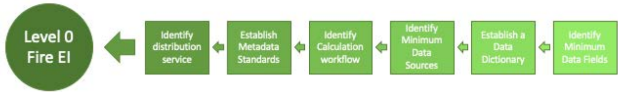
Figure 2. Example of building a conceptual model of a product following the core principles

A core group of experts will initiate the development of the conceptual model by identifying the key products and services needed in line with the core principles, and the major technical barriers to implementation. An example of this discovery process is illustrated in Figure 2.