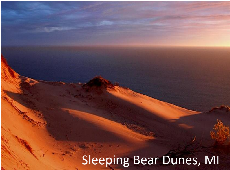
Sleeping Bear Dunes, MI